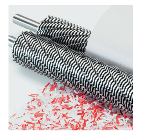
SOLID STEEL CUTTING SHAFTS

Robust and durable: high-quality paper clip proof cutting shafts with lifetime guarantee under conditions of fair wear and tear.