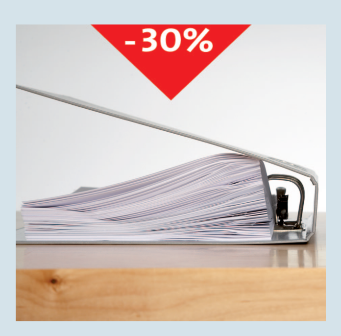
With stapling legs resting flat against the paper, flatclinch stapling cuts filling space by as much as 30 %.