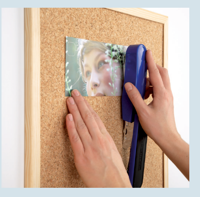
The third method of Novus dektop staplers: nailing. With this method, the staple ends are not bent over but sunk vertically into the stapled object.

With the new two-stage stapling action, the staple legs pierce the paper first. The staple ends are then bent over and pressed absolutely flat against the paper.