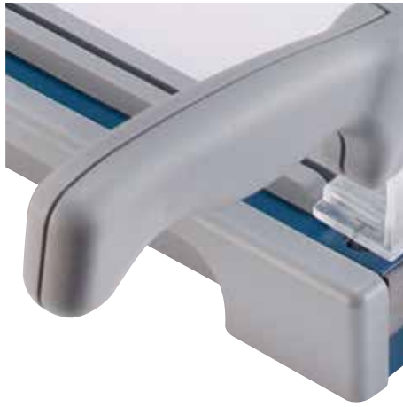
Ergonomically shaped handle to prevent tired hands while cutting