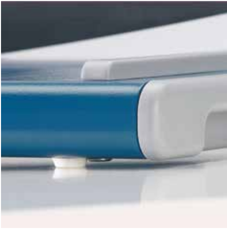
Non-slip rubber feet for firm standing