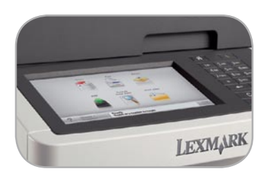
1) Intuitive colour touch screen Operate your device with ease through smart and intuitive navigation. Receive audible and tactile feedback when you use the