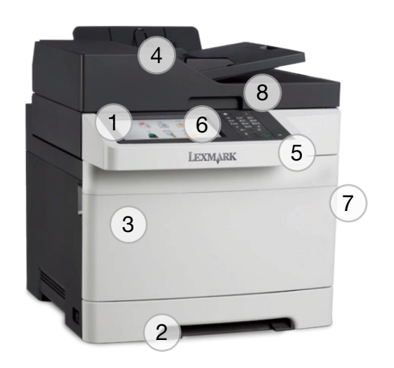
XC2132 with 7-inch colour touch screen