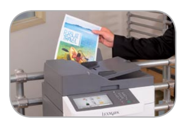
2) Flexible media handling Print on a wide range of media with built-in 2-sided printing. Add additional input capacity up to 1450+1 pages for higher volume output needs.