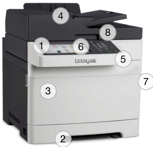
XC2132 with 7-inch colour touch screen